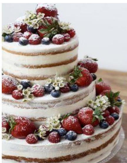
Forest Fruit Cake, Sponge Cake with Forest Fruit & Vanilla Butter Cream €400