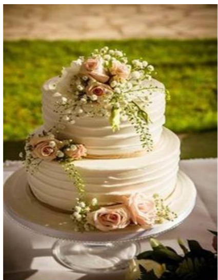
Classic Sponge Cake, with Apricot Jam & Vanilla butter Cream €200