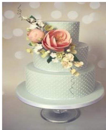
Chocolate Cake, Real Dark Chocolate with Dark Chocolate ganache €300